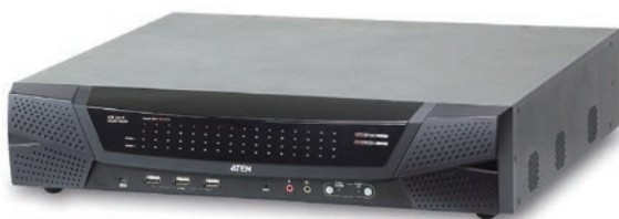
KN8164V Front view